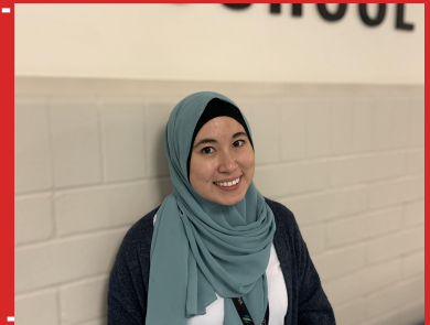
ASMA Mental Health Capacity Builder